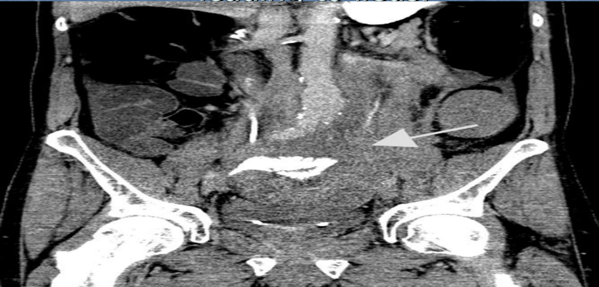
Figure 2. Coronal reformation of abdominal CT displays RPF (arrow) with bowel compression leading to ileus.